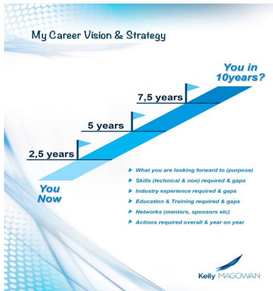
Traditional Career Management Model